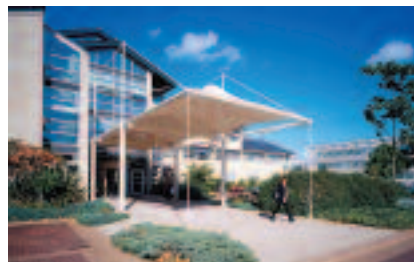
The Magdalen Centre South entrance