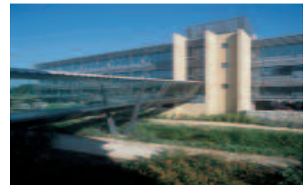
The bridge link to Magdalen Centre North